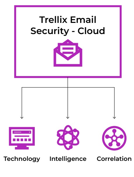
Figure 1: Trellix Email Security – Cloud as a secure email gateway

While ransomware attacks start with an email, a callback to a command-and-control server is required to encrypt the data. Email Security – Cloud identifies and stops these hard-to-detect multistage malware campaigns.