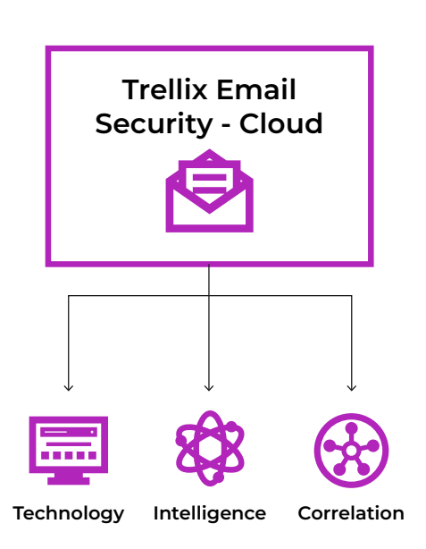
Figure 1: Trellix Email Security – Cloud as a secure email gateway

While ransomware attacks start with an email, a callback to a command-and-control server is required to encrypt the data. Email Security – Cloud identifies and stops these hard-to-detect multistage malware campaigns.